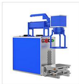
Model : FGXXH