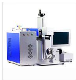
Model : FGXXT