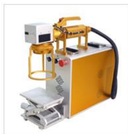
Model : FGXXHB