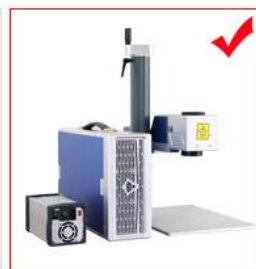
Model : FGXXT2