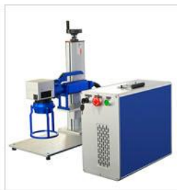
Model : FGXXT1