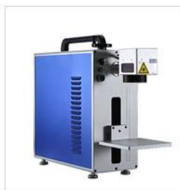
Model : FGXXHB1