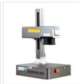
Model : FGXXHB3