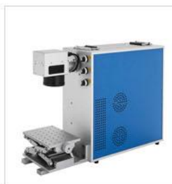
Model : FGXXHB2